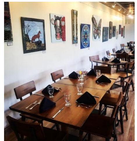
Field & Vine dining room