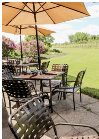
Field & Vine patio